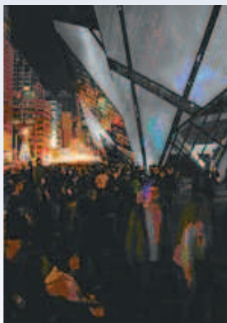
Scotiabank Nuit Blanche 2007, Royal Ontario Museum, Ground Loop Alibi, 2007

Plan now, for this year's Nuit Blanche, which will run from 6:52 pm on Saturday, October 4 to sunrise 7:00 am on Sunday, October 5. Toronto's free, all-night celebration of contemporary art will feature exhibitions by four local and national curators.