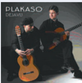
'Plakaso' performs August 4th (Civic Holiday) and August 24th

The Bloor-Yorkville BIA is proud to present another season of Summer Music In The Park for 2008.